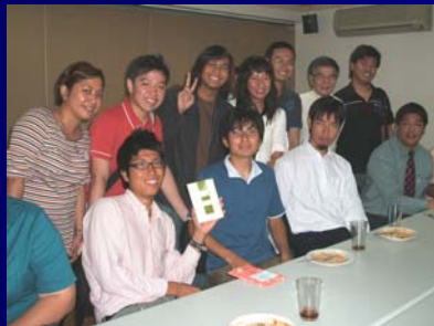
Tokyo Tech & DLSU Students