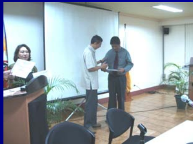
UST Faculty of Engineering