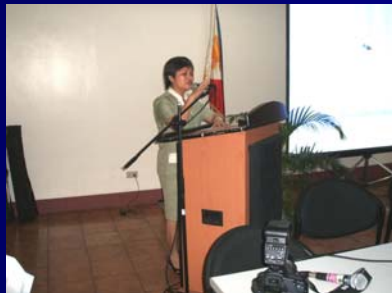
Welcome Remarks from UST Administrator